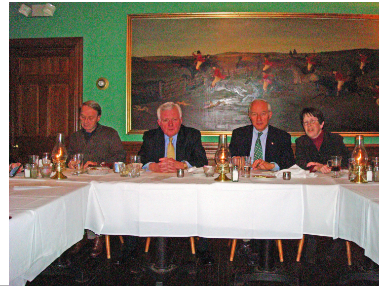
Planning Committee Meeting April 3, 2008 @ the Valley Inn